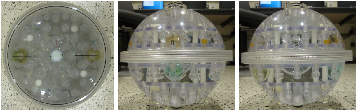
Figure 1: The Magphan® EMR051 Quantitative Imaging Phantom, seen from “anterior,” “right,” and “superior” direction (in “patient coordinates,” pictures from left to right).